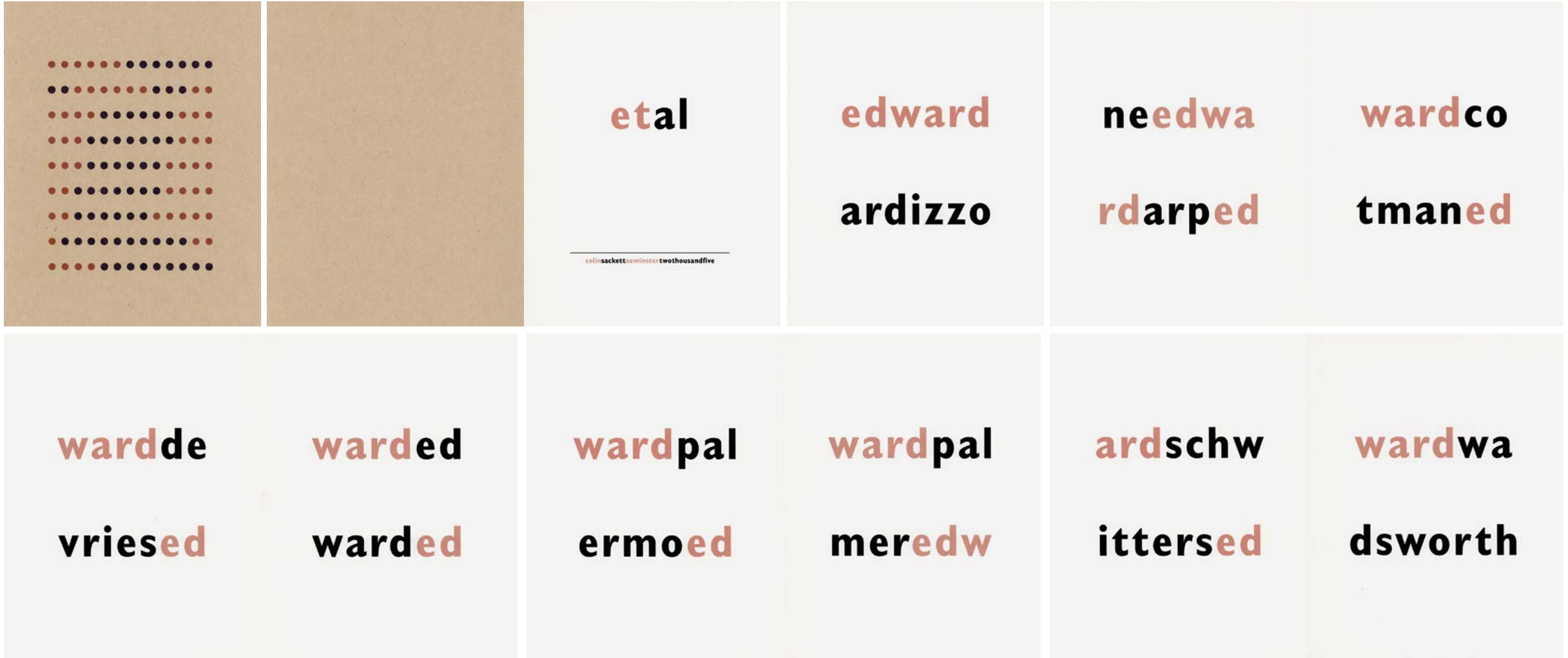
12pp, 190 x 150, inkjet on white cartridge and buff manilla cover, sewn pamphlet; Axminster, 2005.