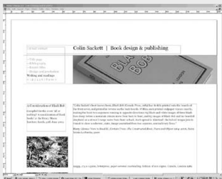
1.3 'A Consideration of Black Bob'. The upper part of the proposed layout of the web page using Indesign, showing text/image frames and rules. The content is as in 1.2 above but image and text are in a vertical arrangement.