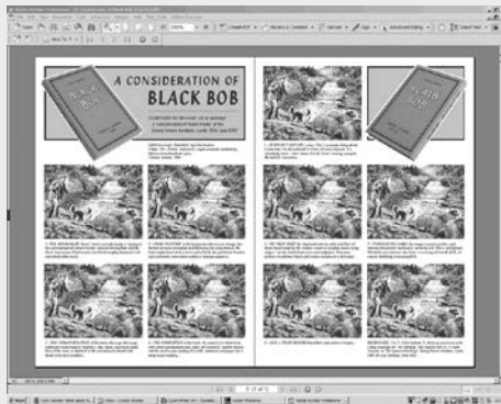
1.2 On-screen PDF, showing the front and reverse of the leaflet A Consideration of Black Bob (Compiled for the event 'All or nothing? A consideration of blank books' at the Henry Moore Institute, Leeds, 25th June 2005). The repeated image and quotations are laid-out in the form of a strip sequence with numbered captions.