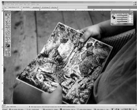
1.1 Image viewed in Photoshop, showing an open spread from Black Bob (London, 1989). This photograph, taken in 1998 has been reproduced on several occasions, and the willing reader in this case is the author's daughter Bethan, then aged four.