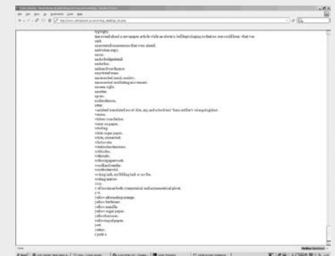
2.43 scrolled to bottom: "typingby... z path z".