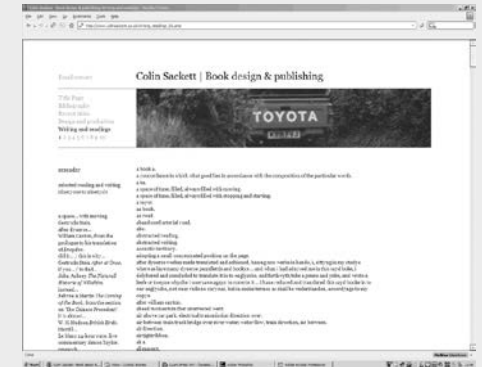
2.41 'rereader'. Top of web page in browser: "a... alignment". http://www.colinsackett.co.uk/writing_readings_01.php