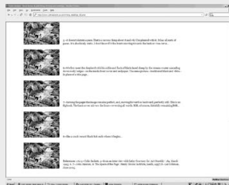
1.43 scrolled to bottom.