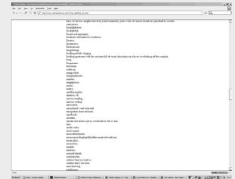
2.42 scrolled to middle: "lines... nestleson".