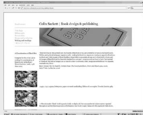
1.41 'A Consideration of Black Bob'. Top of website page in browser. http://www.colinsackett.co.uk/writing_readings_02.php