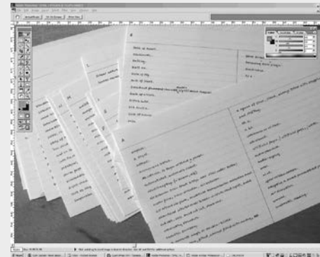
2.1 Digital photograph viewed in Photoshop, showing the handwritten file cards used for the collating of texts for the alphabetical collection 'rereader'.