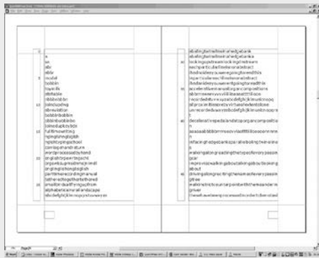
3.21 Double page layout in Quark, showing guides and text boxes of the small private-reading essays (Axminster, 2001), pp.10–11.