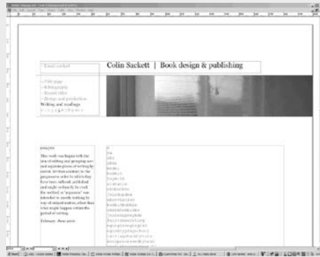
3.3 'essays'. The upper part of the proposed layout of the web page using InDesign, showing text/image frames and rules. The image shows a section of the enamel sign (left, 3.1).