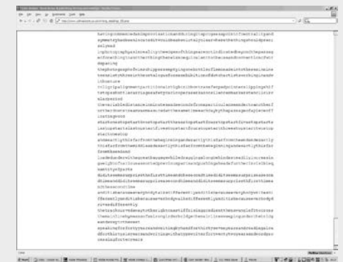
3.48 scrolled to bottom.