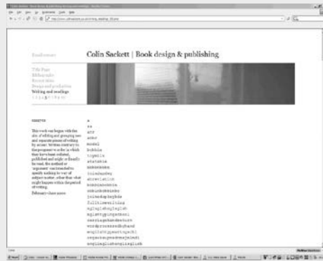
3.41 'essays'. Top of web page in browser. http://www.colinsackett.co.uk/writing_readings_05.php